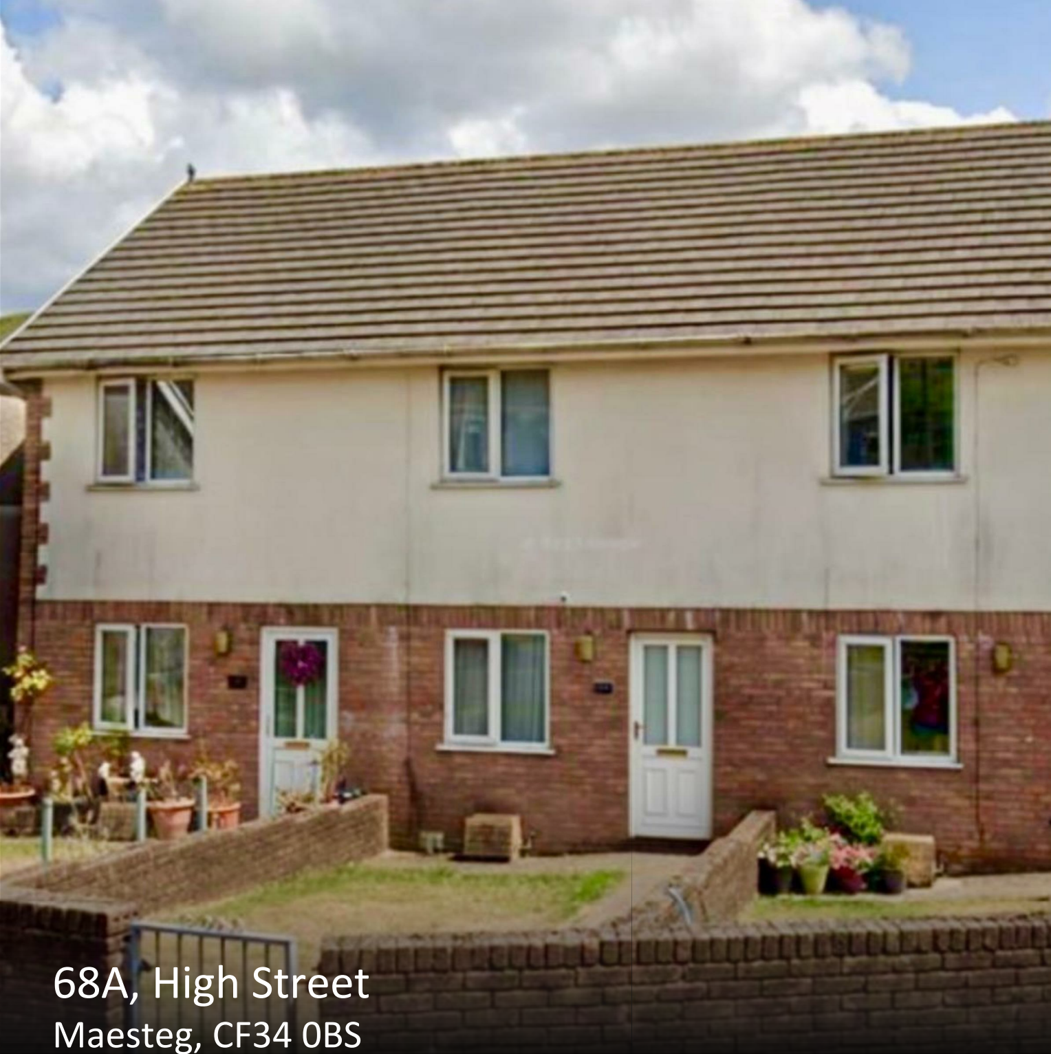
68A, High Street Maesteg, CF34 0BS